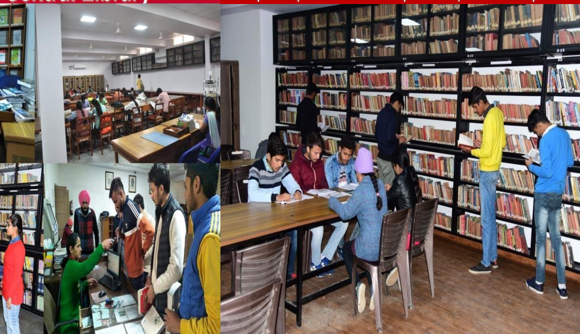
College Information Management System

Free Access to more than 2000 Tutorials/Videos